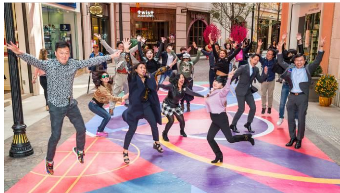
Lee Tung Avenue invites the public to be part of the art piece

The contemporary art 'In the Mood For Love' is open to the public from 1 to 31 March in Lee Tung Avenue.