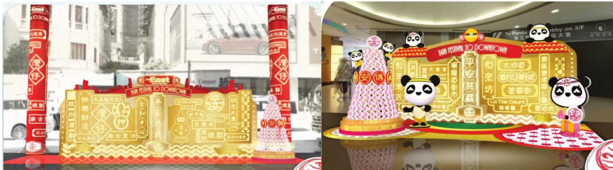
Image link : https://drive.google.com/open?id=1J4yuWFJCPGXBgZM4fqm3yK2ZiDGV1xpW

Various free workshops and celebration activities that are not to be missed