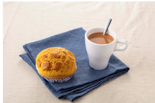
Lucky Bun Set* (HK$18)

Lim Kee Bing Sutt G28-29, Lee Tung Avenue 3468 2971