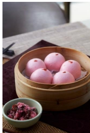
Steamed Cherry Blossom Bun