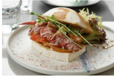
Grilled Live Lobster Bun (HK$168)