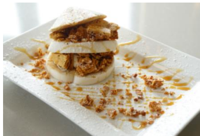
Homemade Honey Crumbs with Mascarpone (HK$68)