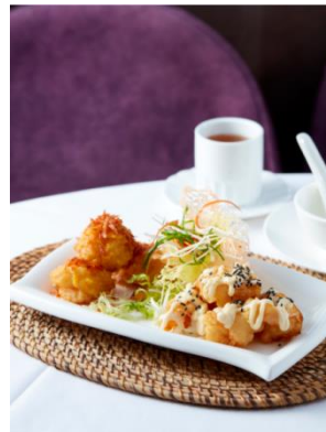
Tai Chi Shrimp Balls - (HK$238)