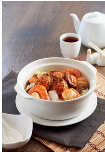
Braised Seafood and Chicken in Hua Diao Wine Sauce (HK$358)

Apart from that, merchants of the Lee Ave will launch special promotions during the Bun Festival.