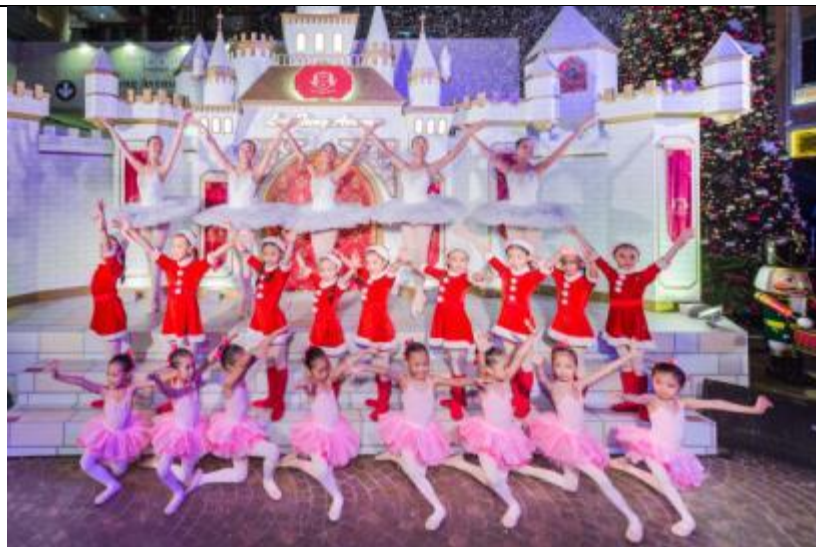
LEE TUNG AVENUE has invited talented ballerinas from Jean M. Wong School of Ballet, Chapio Youth & Children Ballet Company and other experienced dancers to perform