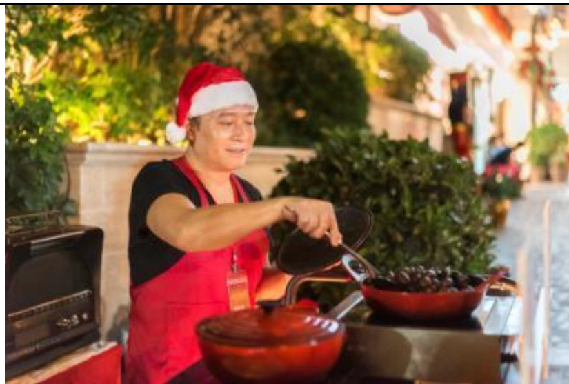
Complimentary and warming roasted chestnuts will also be offered for free by LEE TUNG AVENUE on selected days during the Christmas period – a perfect way to compliment your chilly winter stroll.