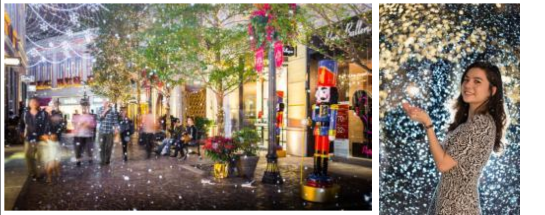
LEE TUNG AVENUE embraces the festive season with the first-ever performance of Nutcracker Ballet Snowflake Fairy Parade, the sight of snowy flair and delightful seasonal music all filled in the air.