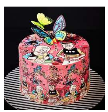
Ms B's CAKERY is selling a brand-new series of Old Master Q cakes, one of which is inspired by butterflies. The shop will be even transformed into a butterfly house, which surely will become one of the best photo spots.