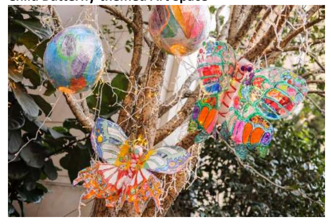
Child Butterfly-themed Art Space

"Butterflies of Hope" is appreciated by different organizations including official collaborative partner "DesignInspire", and will be featured on the Hong Kong Tourism Board "WinterFest" official website, also is one of the satellite events of "BODW CityProg" of Hong Kong Design Center. While traveling out of town is off the table this year, why not celebrate the festive season at the spacious and Christmassy Lee Tung Avenue?