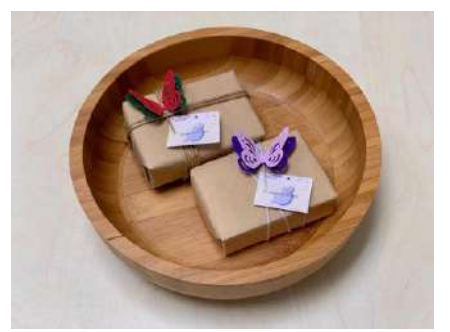
Soap Cycling will make unique butterfly-themed soaps for charity sale. Charity sale of DIY upclycling kit will be held during weekends and Christmas to spread the message of environmental protection.